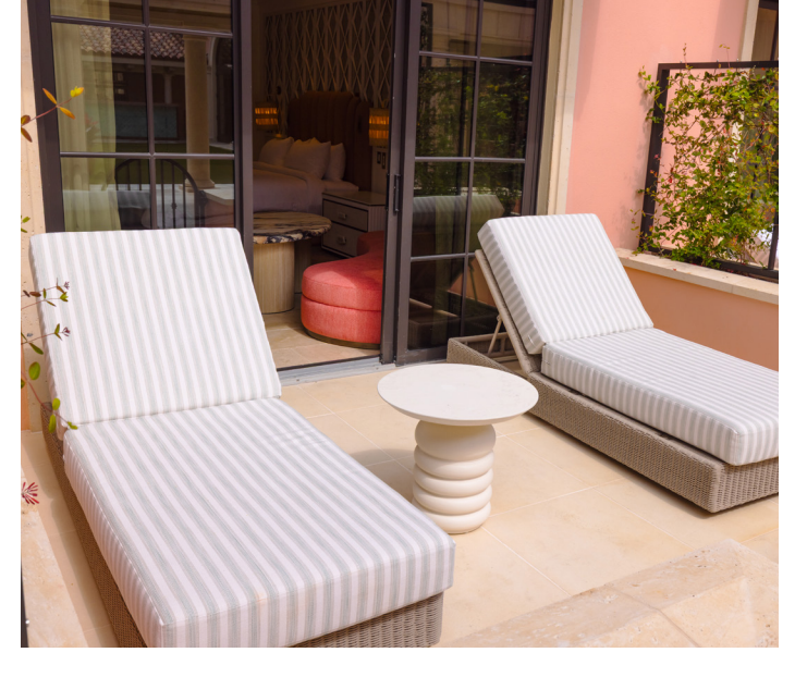
Follow Us: @bernhardthospitality